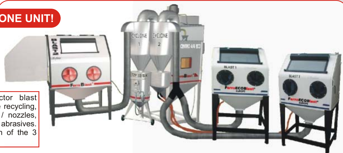
Pressure and injector blast system with abrasive recycling, using 3 blast guns / nozzles, using different kind of abrasives. Simultaneous suction of the 3 blast cabinet.

The CENTRO recycling filter unit is a stand-alone equipment, which can be connected on any side of the blast cabinet. It is used for the ventilation of the blast cabinet, the recovery of the abrasive, the cleaning of it and the separation of dust, and the return (recycling) of the clean abrasive into the cycle. The separation (cleaning) is done in the cyclone integrated in the filter unit. The performance of that system will enhance the economical and ecological value of your sandblast equipment.